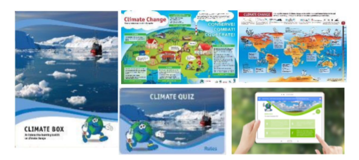
Figure 2. What is inside the box

Climate Box toolkit materials can also be accessed online, via Climate Box website at <a href="https://www.climate-box.com">www.climate-box.com</a>.