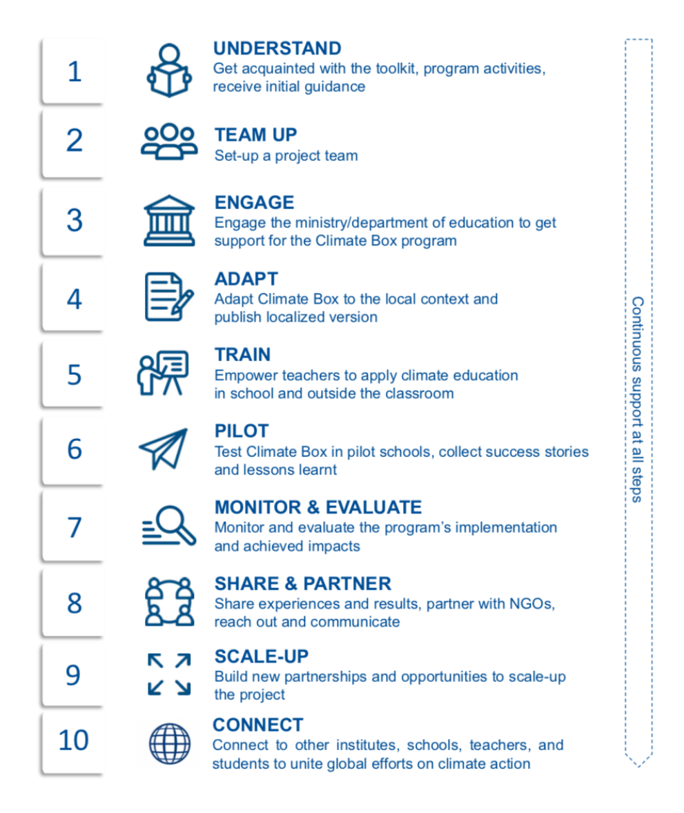
Figure 1. Recommended steps for the Climate Box program implementation

Below, you find ten recommended steps (Figure 1) and components vital for a successful implementation of the Climate Box program. Each step is further elaborated in the following sections for greater understanding. Note that some of the steps and activities do not follow a strict sequential order but can be implemented in parallel (e.g. Step 4 "Adapt" and Step 5 "Train" can occur simultaneously).