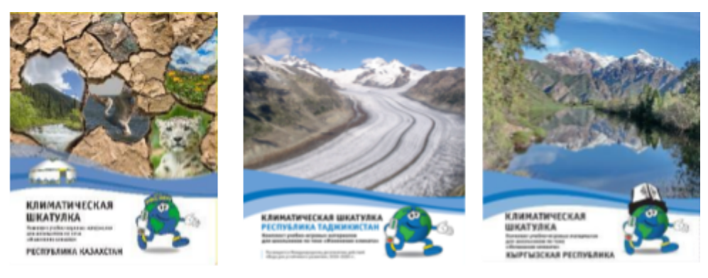
Figure 3. Examples of different Climate Box cover designs from (left to right): Kazakhstan, Kyrgyzstan and Tajikistan