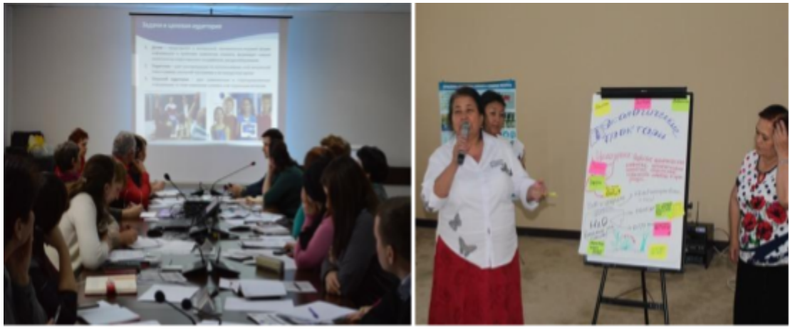
Figure 4. Teachers at trainings in Moldova (left) and Uzbekistan (right)

The training program was initially developed by a group of educational and climate experts from Russia and afterwards successfully realized in eight countries of Eastern Europe and Central Asia. In total, over 700 teachers have participated in training sessions.