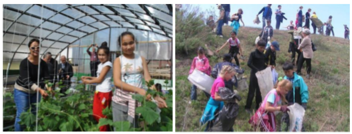
Figure 5. Engaging activities (left) and out-of-classroom actions (right) in Kazakhstan.